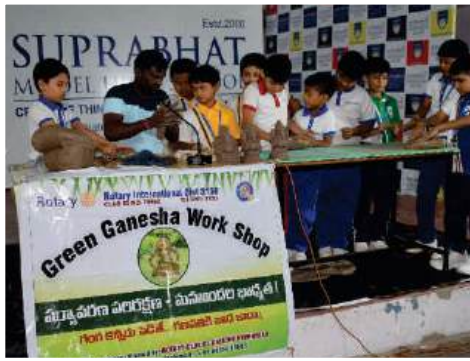
Green Ganesha Workshop