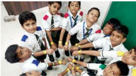
Friendship Band & Photo frame Making