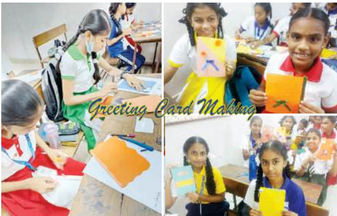
Greeting Card Making