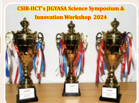
CSIR-IIT's JIGYASA Science Symposium & Innovation Workshop 2024