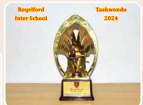
Reqelford Inter School