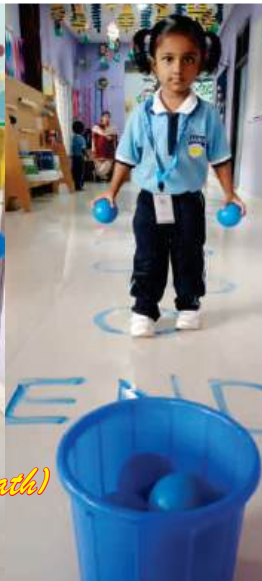
Circle time activity (walk on the path)