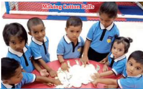
Making Cotton Balls