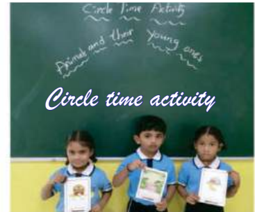
Circle time activity