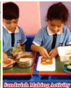
Sandwich Making Activity