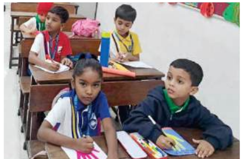
Thank You - Card Making Activity