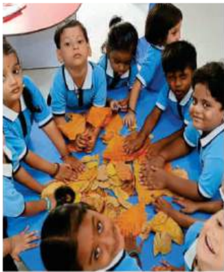
A Tiny Leaf (Story Telling Activity)