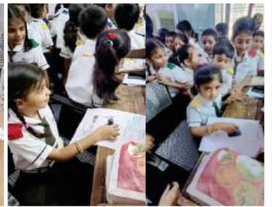
Post Office Visit