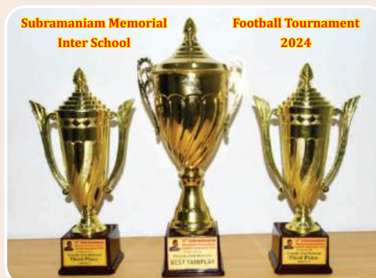
Subramaniam Memorial Inter School Football Tournament 2024