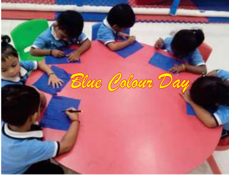
Blue Colour Day