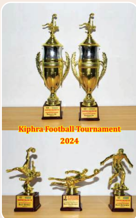
Kiphra Football Tournament 2024