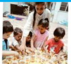
Sapling on Rainy Day