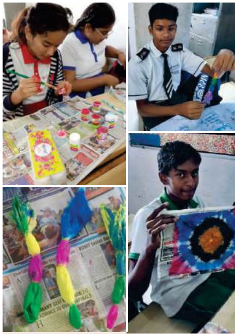
Tie & Dye