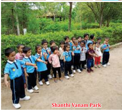
Shanthi Vanam Park