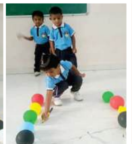
Colours matching with Balloons