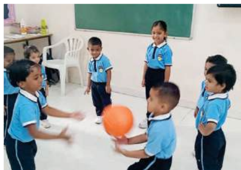
Pass the Ball