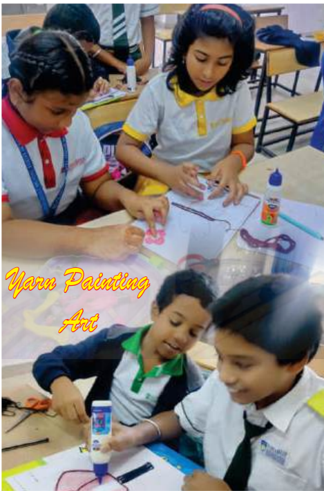
Yarn Painting Art