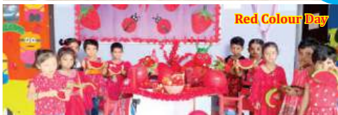
Red Colour Day